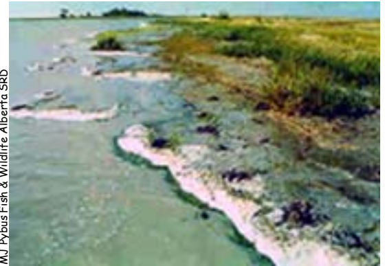
MJ Pybus Fish & Wildlife Alberta SRD

This is followed by loss of the ability to hold the head up ("limber neck") or to breathe. Eventually the bird drowns or suffocates or is picked off by a predator.