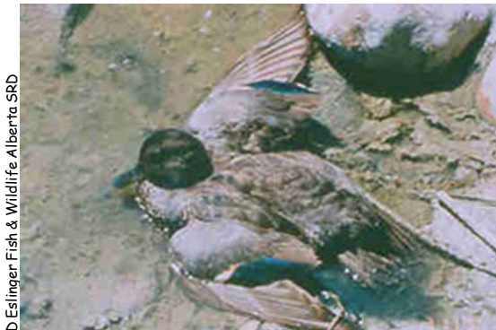
D. Eslinger Fish & Wildlife Alberta SRD

Mortality is limited largely to birds. Mammals, including humans, generally are resistant to this particular form of botulism toxin. Note that this is not the same as the botulism that can occur when foods are improperly canned or stored. In addition, affected birds quickly lose the ability to fly, and thus hunters are not likely to shoot sick birds. Hunting dogs also are not at risk. Rarely, cattle drinking from lakes during large outbreaks may be at risk if they consume large numbers of toxic maggots.