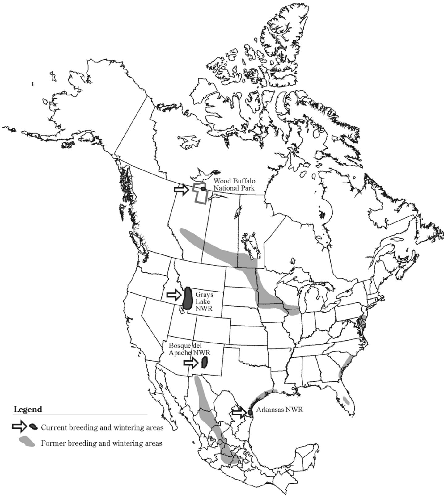
Legend ➔ Current breeding and wintering areas ◐ Former breeding and wintering areas